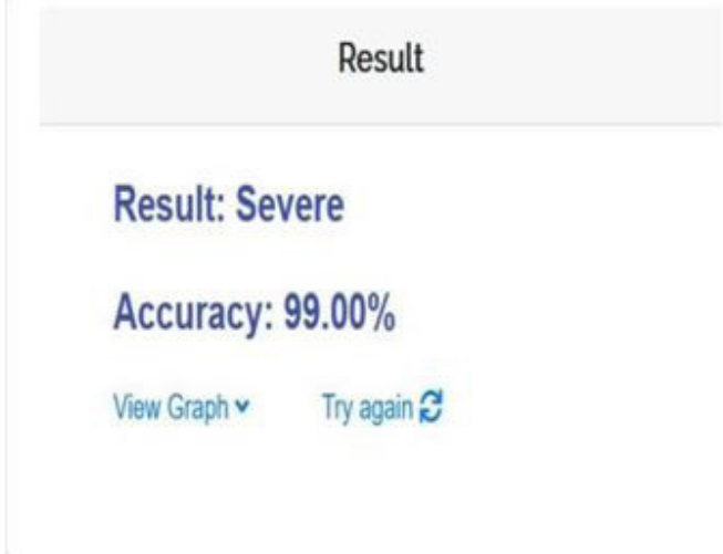
Figure 2: Accuracy of the model

Technology advances have impacted the cryptocurrencies evolution by creating new ways to mine new coins, store the block chains over distributed nodes, secure the network and analyze the huge amount of trades and block chain transactions that are beyond human capabilities. In this study, we presented a survey for the state-of-art research that makes use of artificial/machine intelligence techniques to address the challenges facing cryptocurrencies. The AI research stud addressing Bitcoin are remarkably more than those researching other altcoins. The possible dependencies between cryptocurrencies' prices should be further identified. The possibility of using AI techniques to address security, anonymity and privacy level of other cryptocurrencies is recommended for further exploration as security and privacy are major and critical concerns for traders to gain more trust while trading.