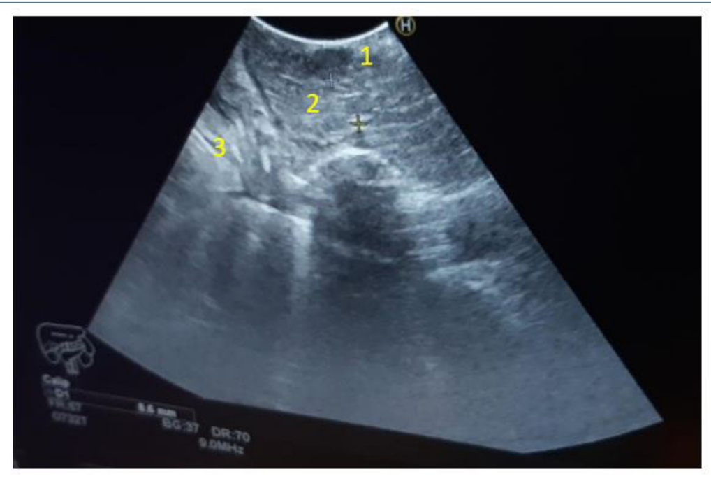
Figure 3: Intraoperative ultrasound: (1) Hypoechogenic tumor mass with a maximum axis of 14 mm in the head of the pancreas; (2) Wirsung's canal with endoprosthesis. Note the double rail image; (3) Second duodenal knee