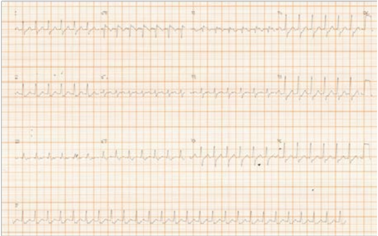
Figure 1: Narrow QRS-complex tachycardia at a rate of 176 b.p.m. Retrograde p waves are observable as negative inscriptions 80ms after beginning of QRS.