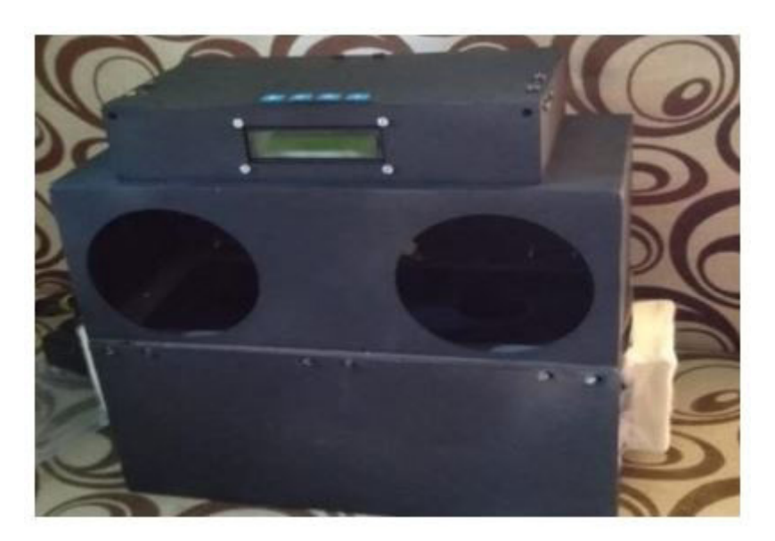
Figure 3: Experiment Setup