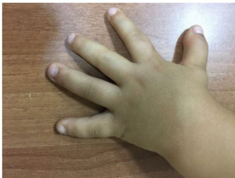
Figure 1: SD-OCT demonstrated microspherophakic lenses with lenticular iris contact and anteriorly displaced irides in association with shallow anterior chambers

A-9-year-old male patient referred with a 9-month-old history of ocular pain and blurred vision in both eyes with redness. There was no history of ocular abnormalities in family members. The best corrected visual acuity was 3/10 in the right eye and 4/10 in the left eye with high lenticular myopic and astigmatic correction. Corneal edema was present and also peripheral shallowing of the anterior chamber was seen in both eyes. The right and left pupil was fixed and half dilated. The intraocular pressure was 45 mmHg in the both eyes. Slit lamp examination revealed a small globular lens, microspherophakia with stretched zonules causing anterior subluxation resulting pupillary block and shallow anterior chamber. Gonioscopy showed grade 2 angles with no peripheral anterior synechia in the both eyes. Extended-depth SD-OCT demonstrated microspherophakic lenses with lenticular iris contact and anteriorly displaced irides in association with shallow anterior chambers (Figure 1). The fundus examination was normal except glaucomatous cupping of optic nerves (C/D 0.5-0.6) in both eyes. On systemic examination, he had brachydactyly, joint stiffness and brachymorphia (Figure 2). After ocular and systemic examination, Weill-Marchesani syndrome was diagnosed.