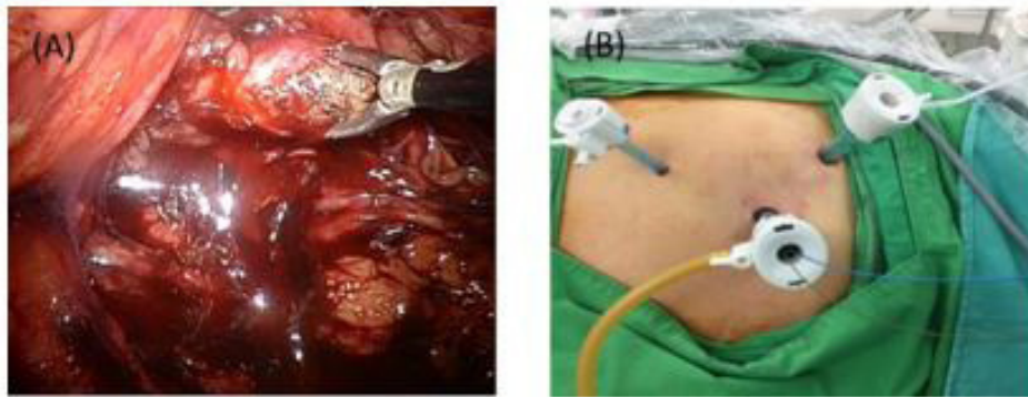
Figure 2: 2A: Ureteral stone was removed. 2B: The metal stents was kept outside the abdomen after pushing D-J stent into peritoneal cavity