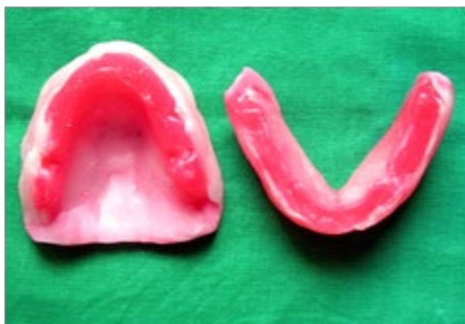
Figure 9: Rim with Neutral Zone Recording