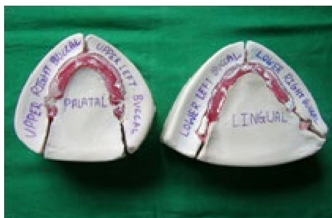
Figure 10: Neutral Zone Rim with plaster indices.