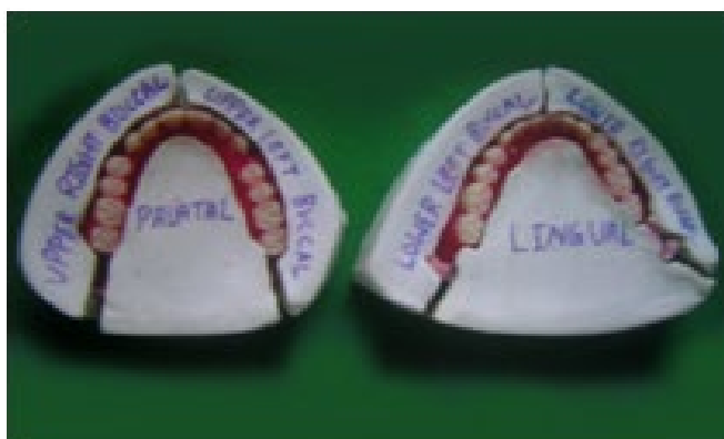
Figure 11: Teeth arrangement in Neutral Zone.