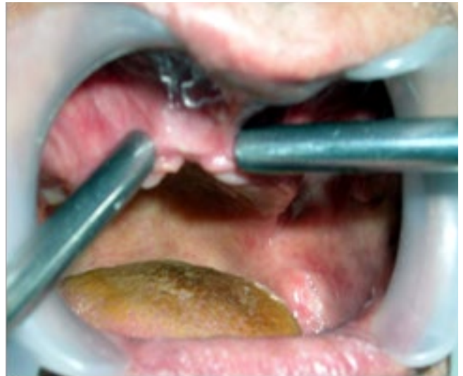
Figure 2: Maxillary Edentulous Ridge with Flabby Tissue.