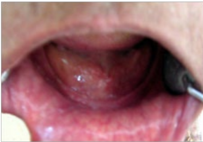
Figure 3: Mandibular Edentulous Knife edge Ridge.