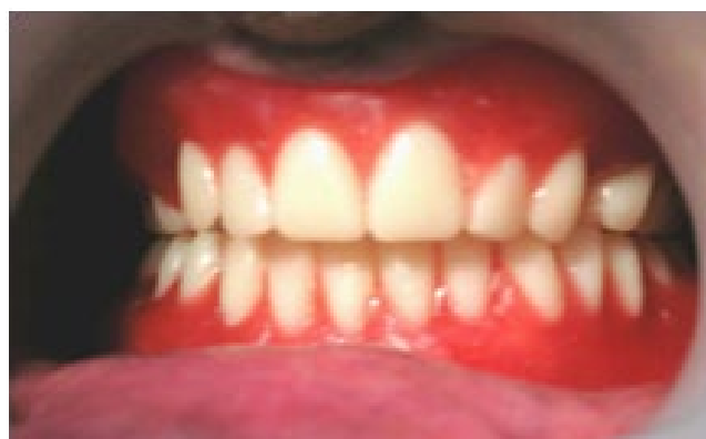
Figure 12: Intraoral view of waxed up denture during Try-in.