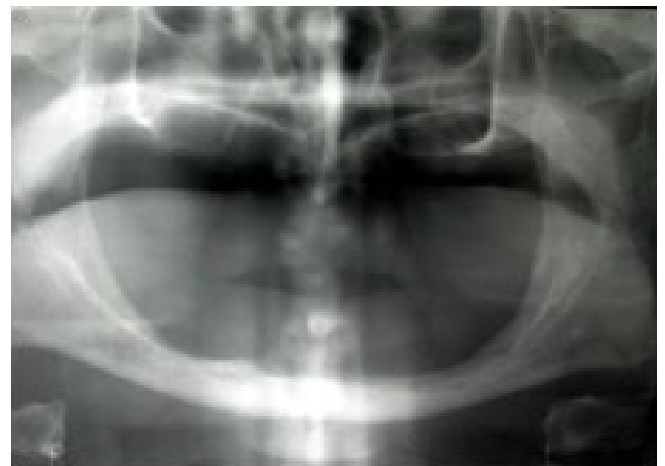
Figure 4: OPG.