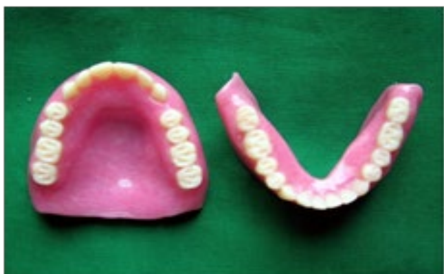
Figure 13: Finished complete denture.