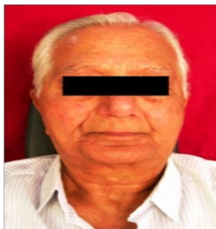
Figure 14: Post-operative Extra oral View.