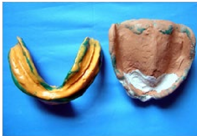
Figure 8: Final Impression.

After removing spacer, the maxillary wash impression using Zinc Oxide Eugenol impression paste was made. A window was made on the marked area for flabby tissue & again verified intra-orally. Paint Impression Plaster on the area of flabby tissue using hair brush to record the tissue in most passive form so that distortion of the tissue can be avoided. After setting of impression plaster, the entire tray was removed from maxillary arch. For mandibular ridge, after removing spacer, tray adhesive was applied on tissue surface & allowed to dry for 10 minutes. Then, light viscosity addition silicone was loaded on the tray & immediately wash impression was made & material is allowed to set for 4 minutes (Figure 8).