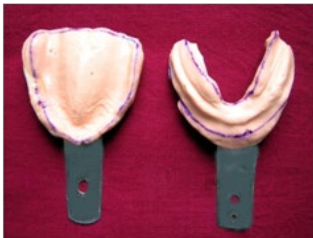
Figure 7: Primary Impression made by Irreversible Hydrocolloid.

After removing spacer, the maxillary wash impression using Zinc Oxide Eugenol impression paste was made. A window was made on the marked area for flabby tissue & again verified intra-orally. Paint Impression Plaster on the area of flabby tissue using hair brush to record the tissue in most passive form so that distortion of the tissue can be avoided. After setting of impression plaster, the entire tray was removed from maxillary arch. For mandibular ridge, after removing spacer, tray adhesive was applied on tissue surface & allowed to dry for 10 minutes. Then, light viscosity addition silicone was loaded on the tray & immediately wash impression was made & material is allowed to set for 4 minutes (Figure 8).