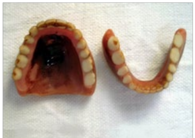
Figure 6: Previous Denture.